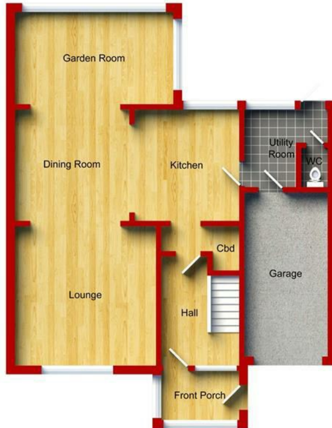
Ground Floor Approximate Floor Area (79.04 sq.m)