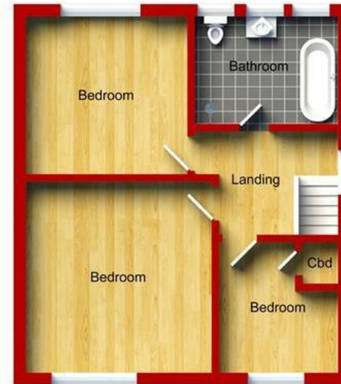
First Floor Approximate Floor Area (45.85 sq.m)